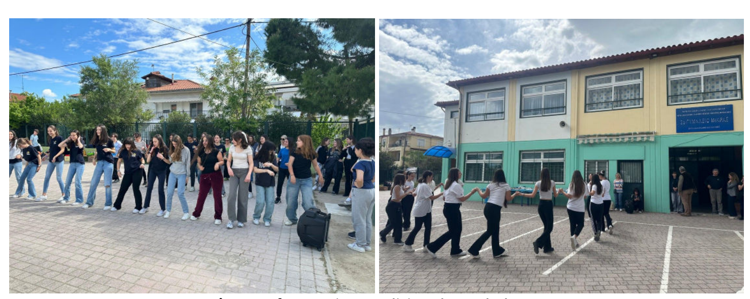
Figure 16. Learning traditional Greek dances