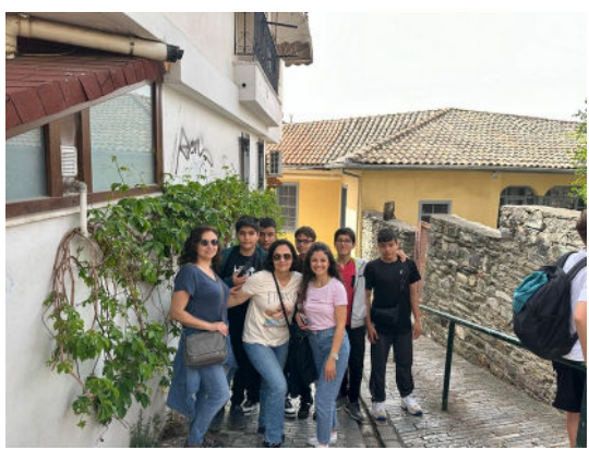
Day 2:Figure 6. Recreating the Byzantine walk in Thessaloniki