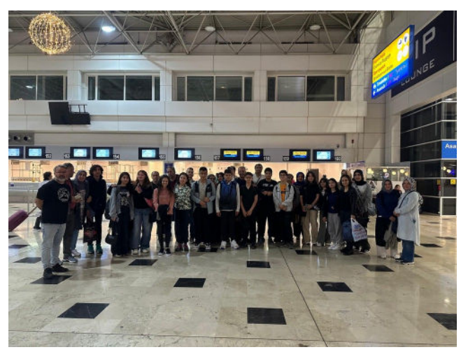
Figure 2. Meeting at the Antalya International Airport to start the mobility.

Arrival Day: The mobility was planned between 13<sup>th</sup> and 20<sup>th</sup> of April. The first day and the last day were planned as the travel days as it was defined in the project application. 12 pupils and 3 teachers participated in this mobility. They met at the airport 13<sup>th</sup> of April, the first flight was to Bucharest. The group arrived Bucharest at early morning and spent the whole day in Bucharest. They exchanged money, did some shopping, got out of the airport and walked around the city for a while, ate lunch, and waited in the airport halls. The arrival to Thessaloniki was at night. The host families were waiting for the group at the airport.