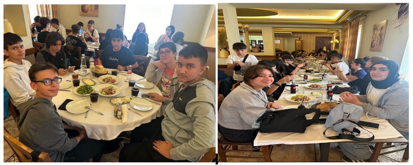
Figure 12.Lunch break at a local restaurant in Edessa