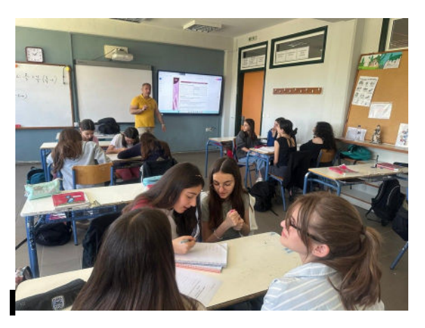
Figure 5. Attending the classes