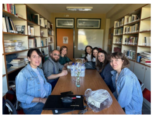
Day 1:Figure 4. Meeting and Ice Breaking Activities in the host school