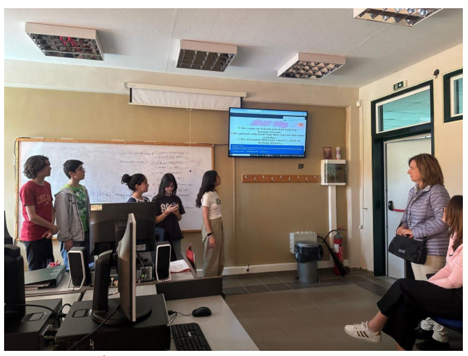
Day 5:Figure 14. Students present their work