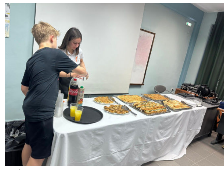
Figure 8. Dinner at host school