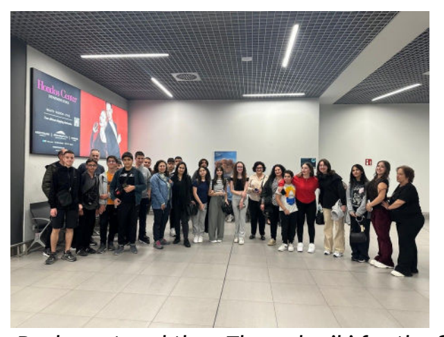
Figure 3. Arriving Bucharest and then Thessaloniki for the final destination.