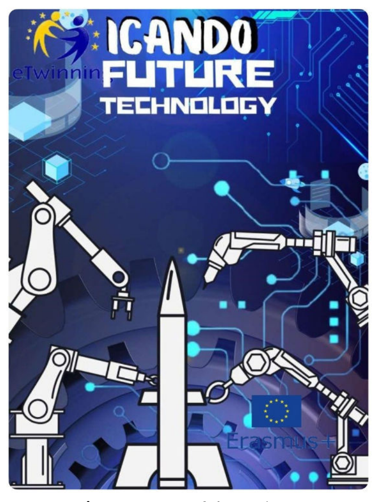
Figure 1. Logo of the Project.

Project Dates: 1st September 2022-1st July 2024