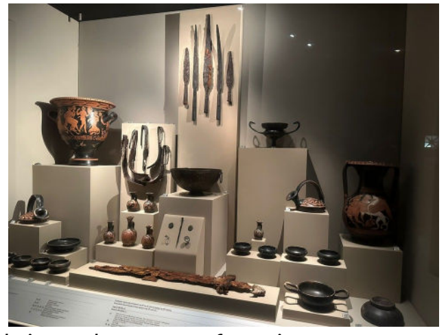
Day 4:Figure 11. Archaeological Site and Museum of Vergina