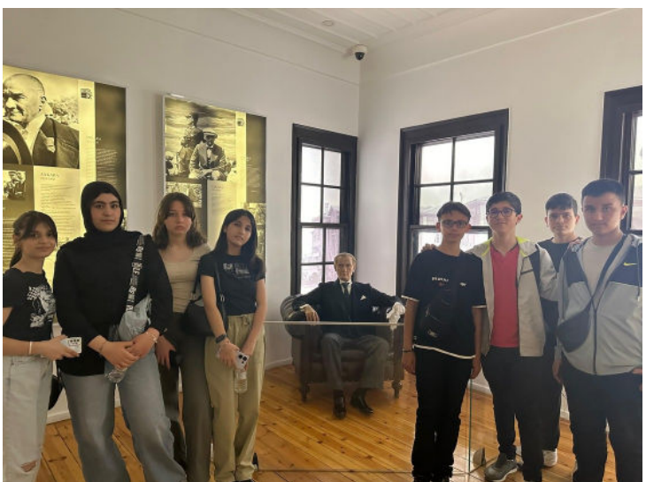
Figure 7. Visiting Atatürk's Museum in Thessaloniki