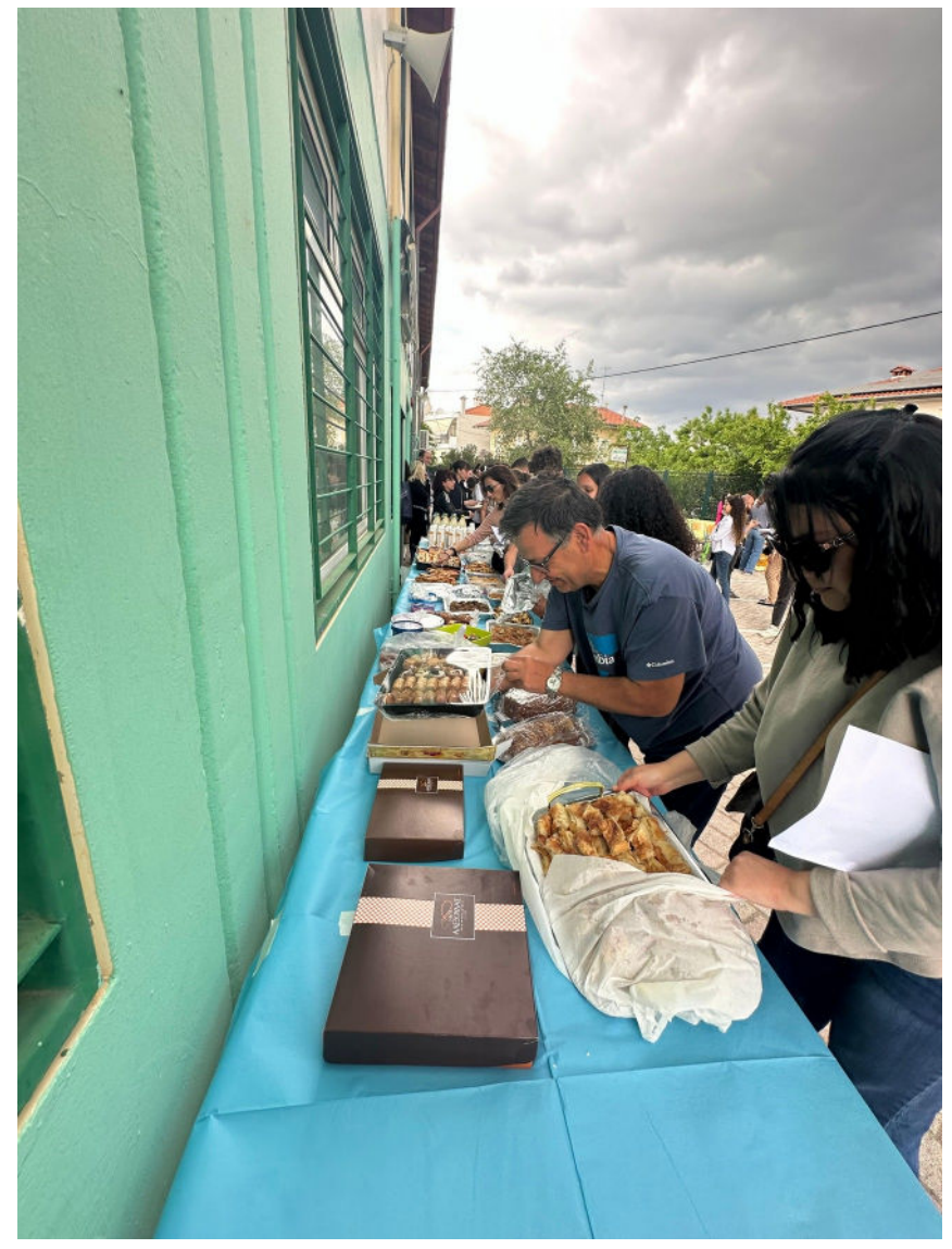
Figure 15. Traditional buffet by the hosting families