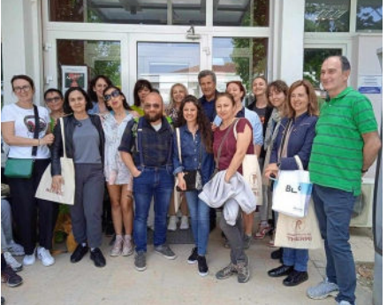
Figure 10. Visiting the City Hall/Meeting the Mayor