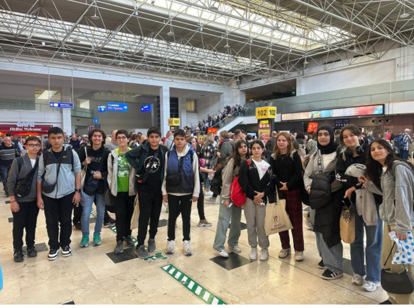
Figure 18. Arriving at Antalya International Airport