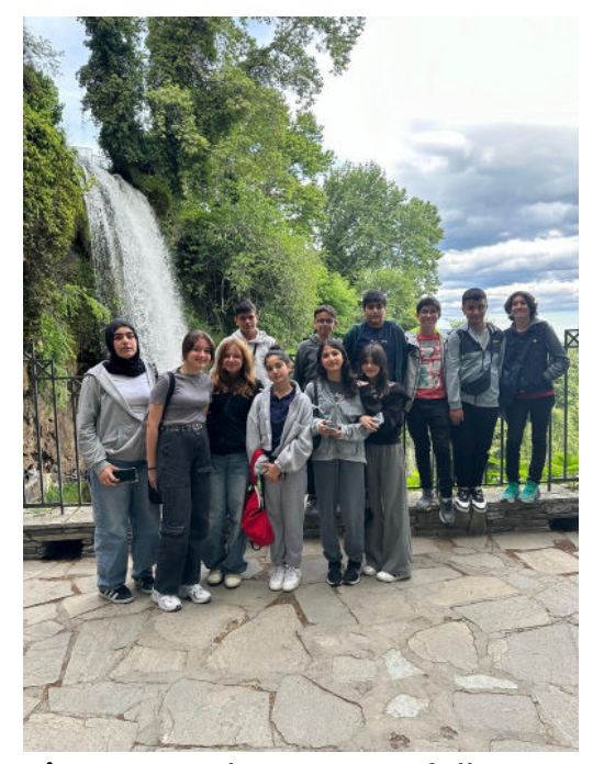
Figure 13.Edessa Waterfall